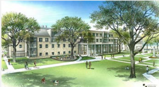
Rendering courtesy of Group Two Architecture

The second phase of a $37 million expansion to Southwestern University’s Fondren-Jones Science Center has broken ground. The center will renovate 38,000 sf of existing space as well as build an additional 20,000 sf.